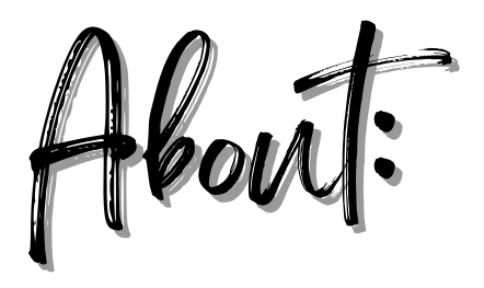
Inside this booklet are awards & adventures that can be earned during the summer months.

Some things in this booklet are going to count towards rank and some are additional awards. You are not required to complete any of these but it is highly encouraged.